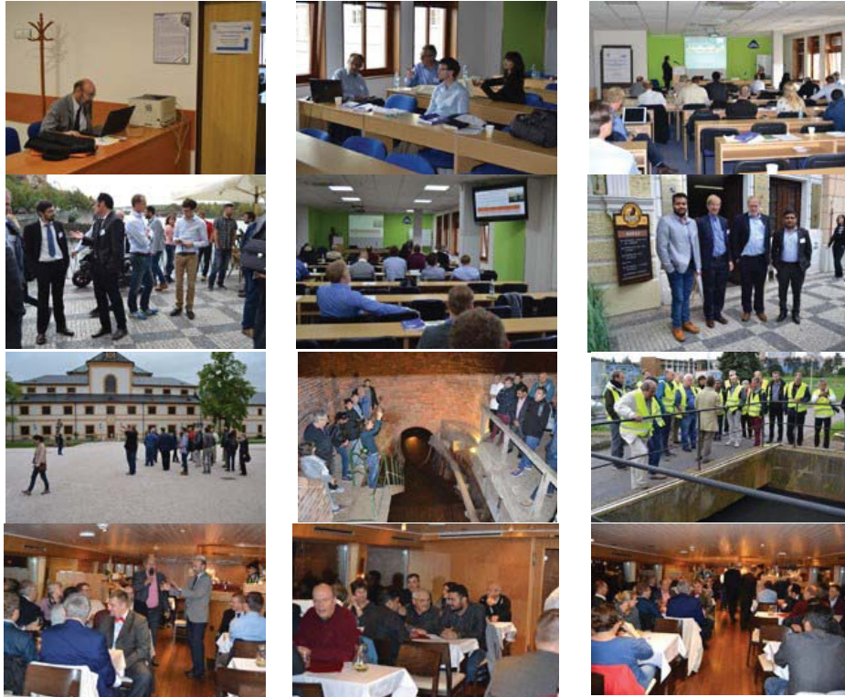
Photo gallery from T&S18, Prague, 2017